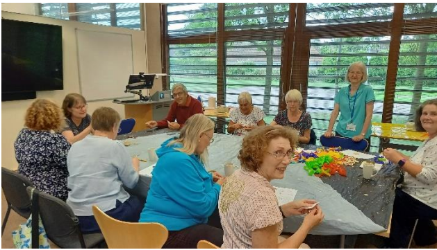
... to explore creativity in poetry and in crafting...