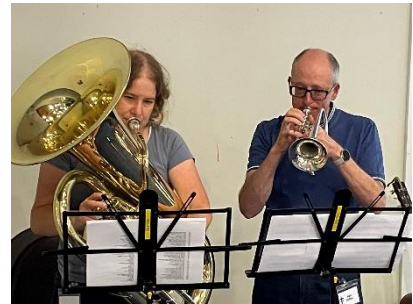
The service included readings and music in many styles, including a new hymn written for the URC's 50 th anniversary.