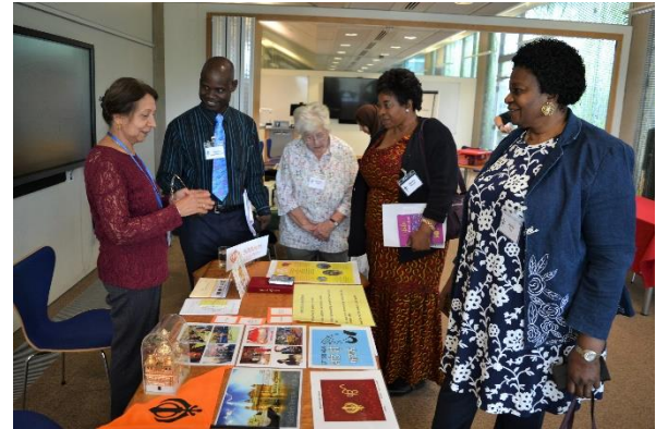
Guests from the St Philip's Centre in Leicester helped us encounter different faiths and sample their foodstuffs. Other features were a Prayer Trail with stations around the lake and a chance to think greener with A Rocha UK .