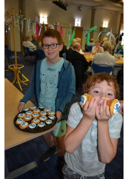
Naturally we sang "Happy Birthday" to ourselves and some of our younger friends helped hand out the cake.