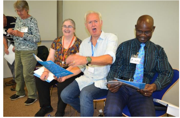
Workshops included opportunities to reenact the parliamentary debate that brought the URC into being...