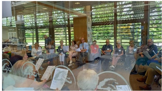
...and to learn new songs for worship.