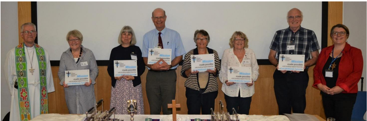
Representatives of six churches were awarded plaques to mark projects supported by the Synod Mission Fund.