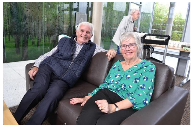
Attendees take the opportunity to relax and mingle in the Conference Centre's atrium