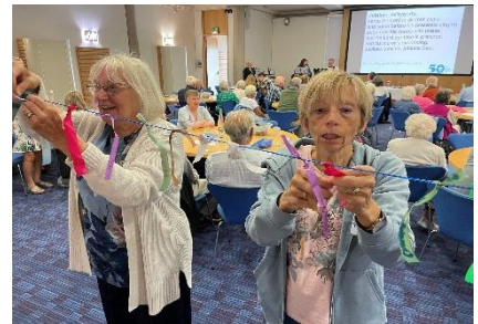
We gave thanks for the URC, writing the things that we value about it onto ribbons and tying them to a washing line.