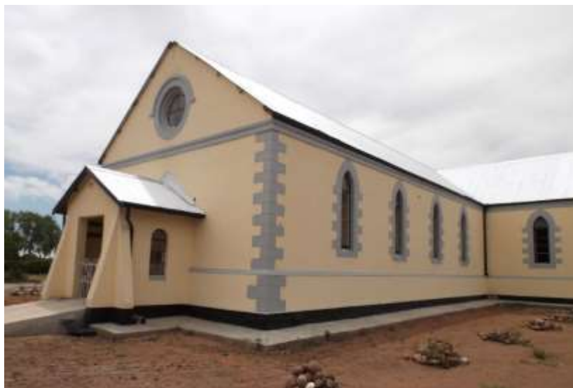
The UCCSA Church in Kanye, Botswana