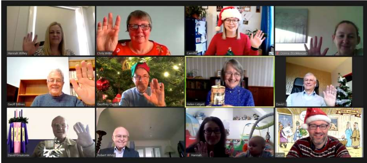
The Synod team pictured at their staff meeting earlier this week.

On behalf of the entire East Midlands Synod team, we extend our warmest wishes to you for a peaceful and blessed Christmas.