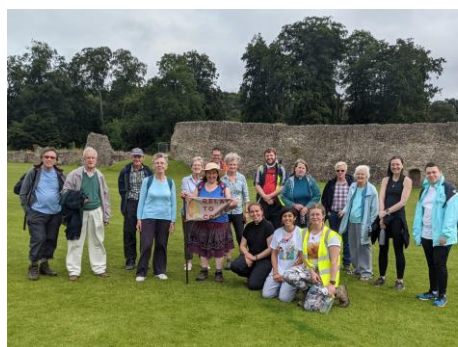
The walkers take a lunch break at Berkhamsted Castle

The walk may have been an act of solidarity, but like all good pilgrimages it was also an opportunity to meet others and to hear their stories, to find out what they were doing for climate justice. I was inspired to hear about the work of two Friends of the Earth lawyers, one working on further legal challenges to the proposed coal mine in the north-east of England and preparing arguments to oppose the Cambo oil field to the west of Shetland; the other working with indigenous peoples around the world where their livelihoods and very existence were under threat as a result of climate change. Equally inspiring was the young woman running a small charity which works with street children in Guatemala, offering them education, support