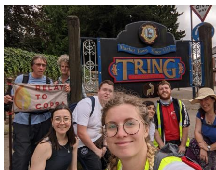
The pilgrims arrive at Tring, their terminus for the day.

Although I had to venture outside the Synod to take part in the relay, there are opportunities for members of churches further north in the Synod to join and I would urge you to take part if you feel able. The relay is passing through Derbyshire on its way to Sheffield with a welcome in Chesterfield on Friday 4 September and all with a concern for climate justice are encouraged to be involved.