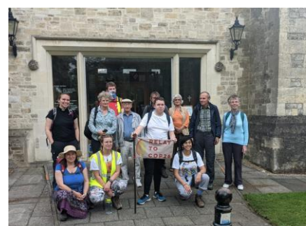
The day's YCCN walkers set out from Hemel Hempstead

It was in response to this call to action made by the Young Christian Climate Network that I determined to express my solidarity for their aims and aspirations by joining them on the relay leg between Hemel Hempstead and Tring . The walk was relatively easy, just under 10 miles along the Grand Union Canal, and the weather was fine, a mixture of sunshine and light showers, at a time when parts of the world were suffocating under record temperatures and destructive wildfires, while others were seeing lives lost as well as houses and buildings and property washed away in devastating floods. The daily pictures on our television screens were a powerful reminder of why we were walking and the sense that inaction is no longer an option.