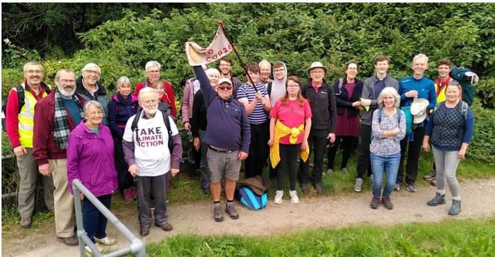
Saturday’s walkers in Tibshelf