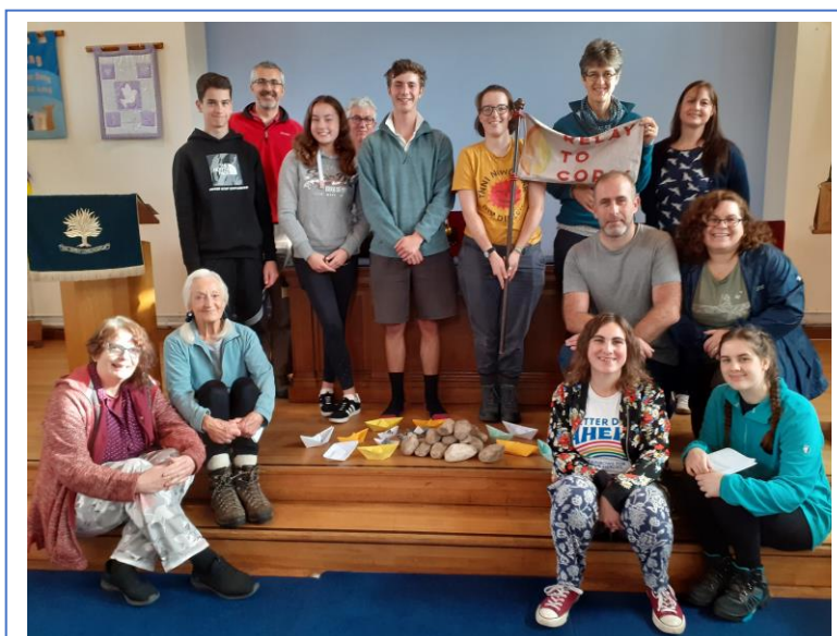
Walkers after the prayer breakfast at St Andrew's URC, Chesterfield