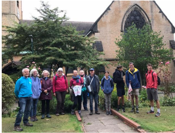
Walkers prepare to leave Hucknall on Friday 3 September

“We are all in the same storm but we are not all in the same boat”