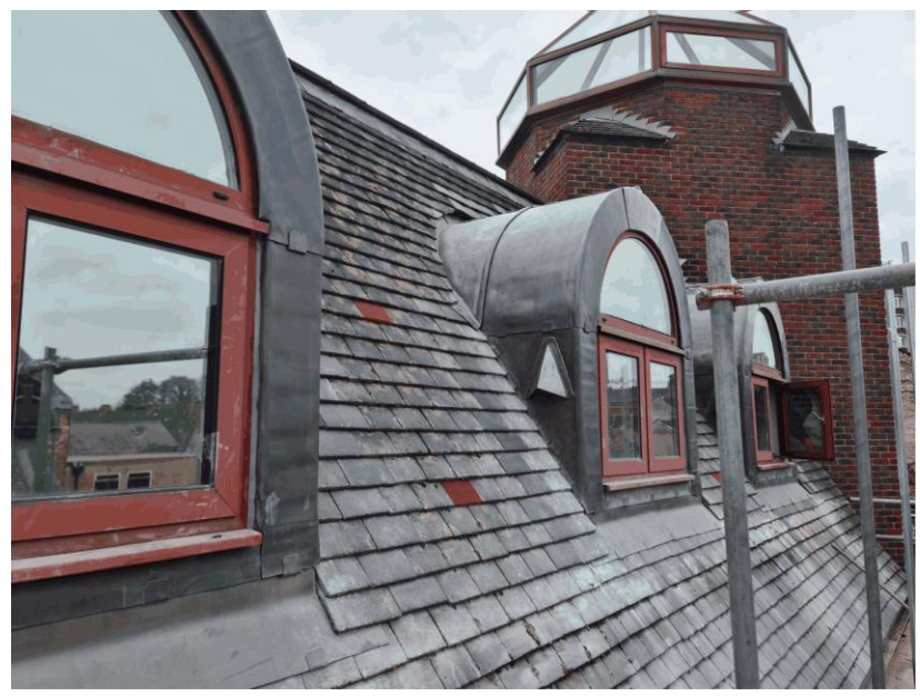
(new church roof)