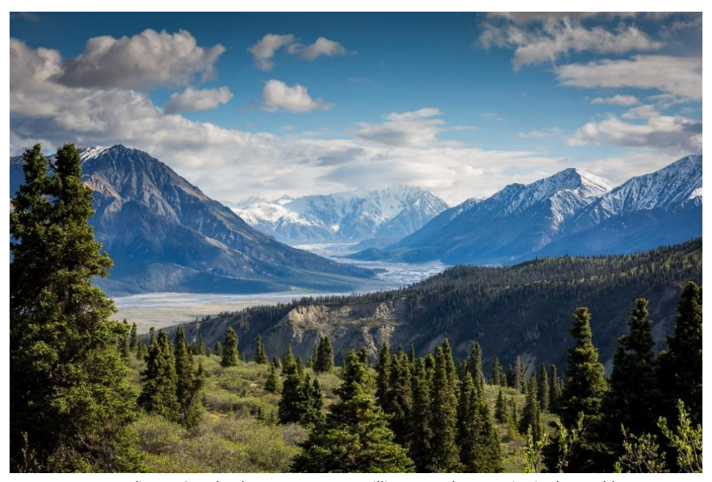
According to Google, there are over 1.1 million named mountains in the world. The Bible contains more than 400 references to mountains.